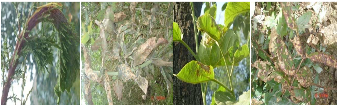
Figure 1: Plantation Samples Showing Stems Canker, Leaves Spot and Tip Blight Symptoms

Leaves and stems were associated with brown to black spots, round to irregular-shaped. Leaf spots were circular or irregular in shape separated or aggregated and often located at the margins with brown, pale brown to grayer coloration while stem canker is observed with elongated, grayish, hell brown to dark brown border between discolored tissue lesions typically on Eucalyptus globulus.